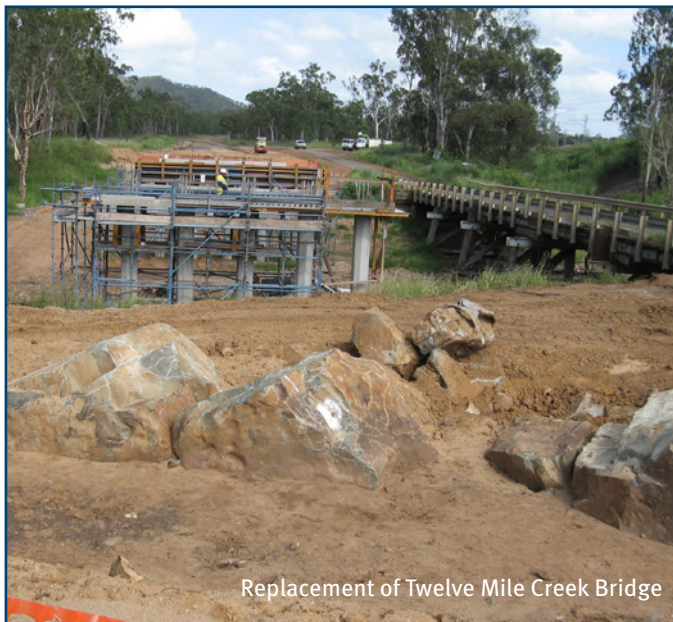
Replacement of Twelve Mile Creek Bridge