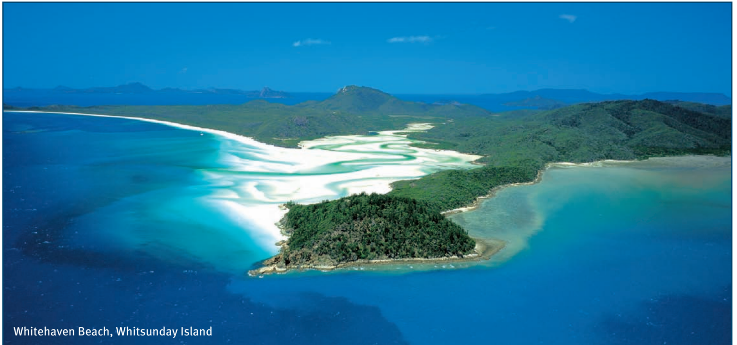
Whitehaven Beach, Whitsunday Island