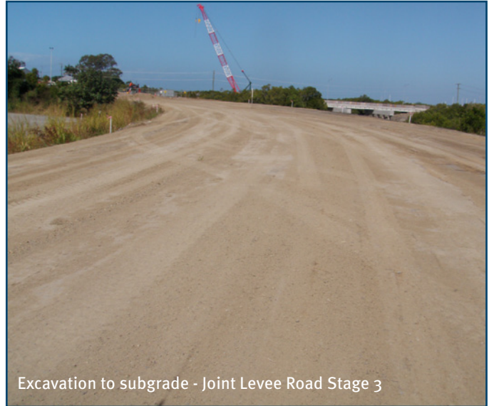
Excavation to subgrade - Joint Levee Road Stage 3