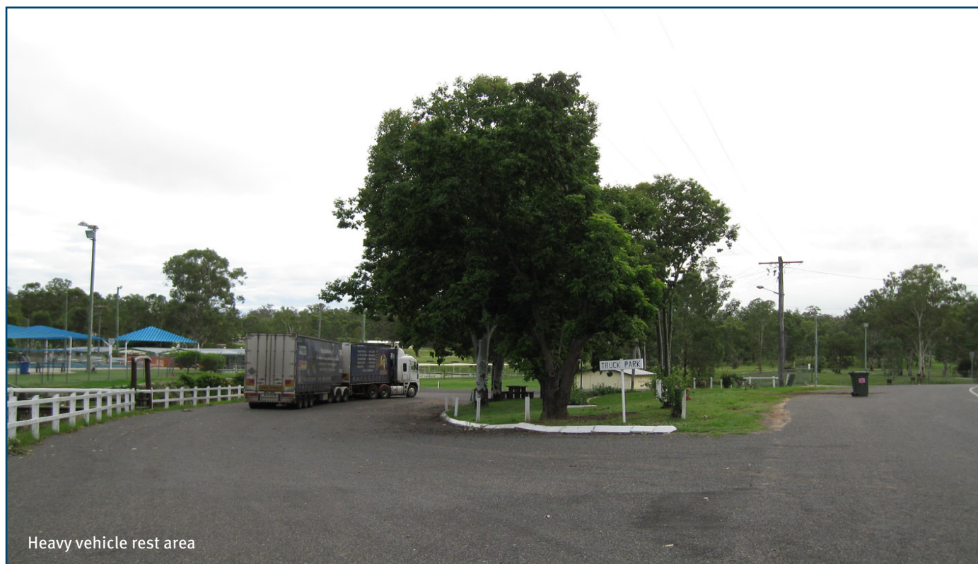
Heavy vehicle rest area